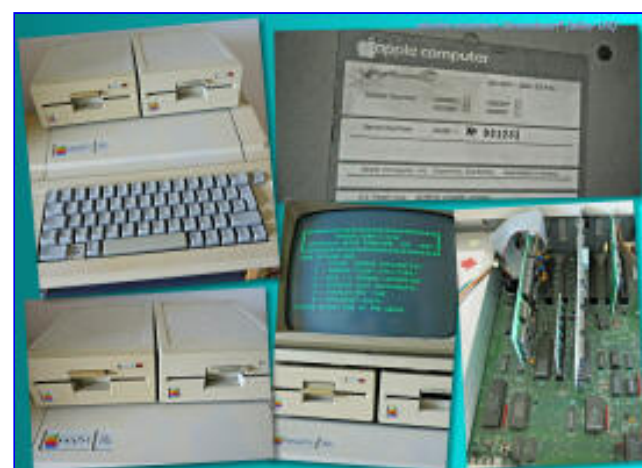
Platinum Apple II/e (Hybrid) A2S2080P model for the United Kingdom