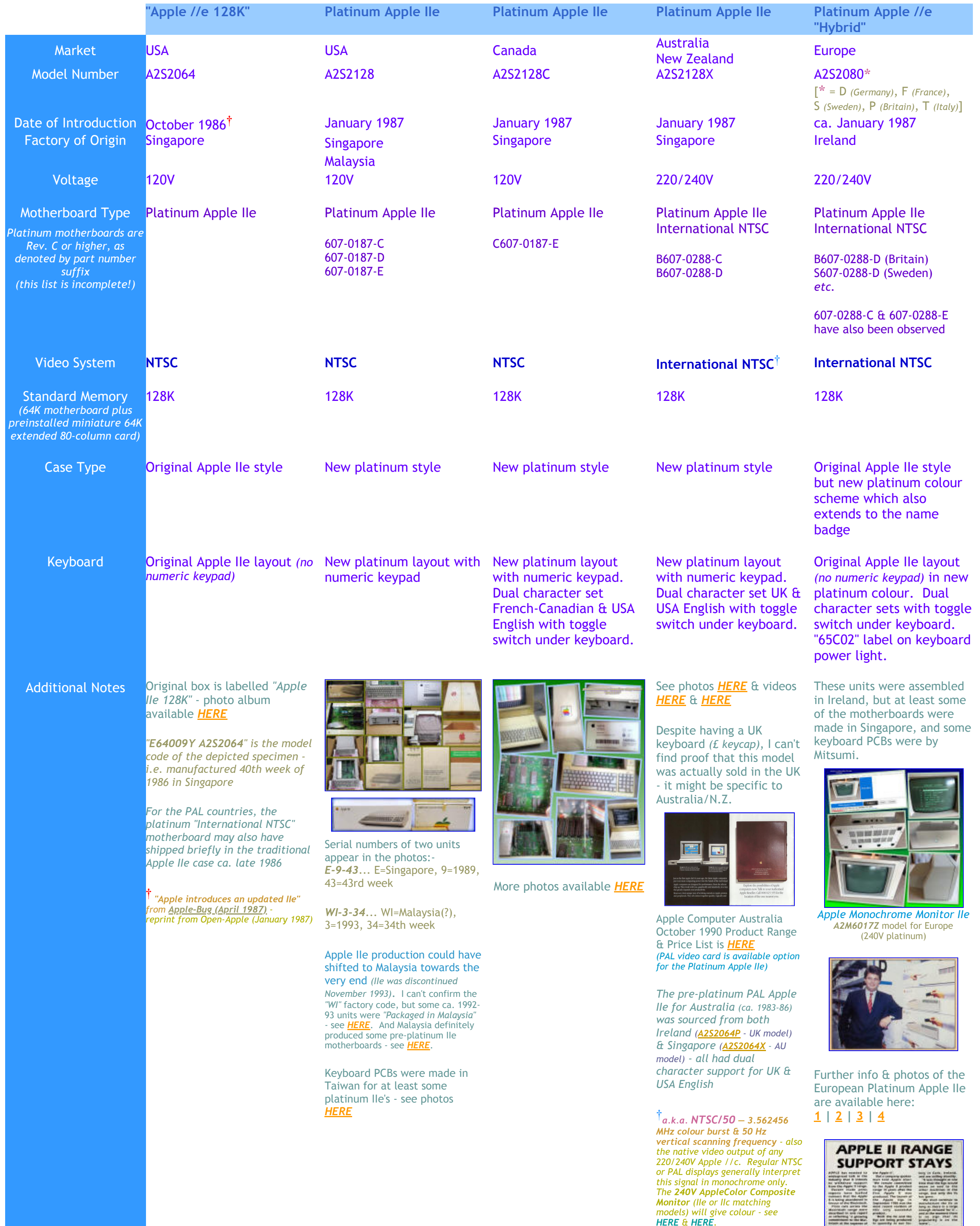
Table comparing known variants of the Platinum Apple IIe

Others ?? I can't confirm whether the Platinum Apple IIe was released in Latin America - a model code "A2S2128E" would be most likely but this is conjecture only. A beige Apple II/e with Western Spanish keyboard does exist (model A2S2064E - 115V NTSC). This model appears related to the Canadian beige Apple II/e (model A2S2064C) - affixed to their undersides is a common model ID sticker for units assembled in Ireland. The Apple II/e was also locally manufactured by Apple de Mexico in Nancitalpan .